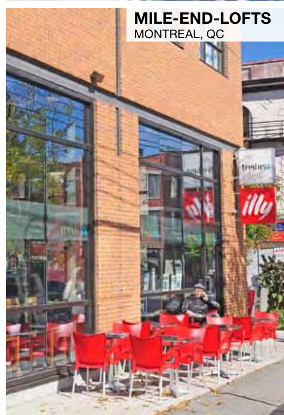
MILE-END-LOFTS MONTREAL, QC