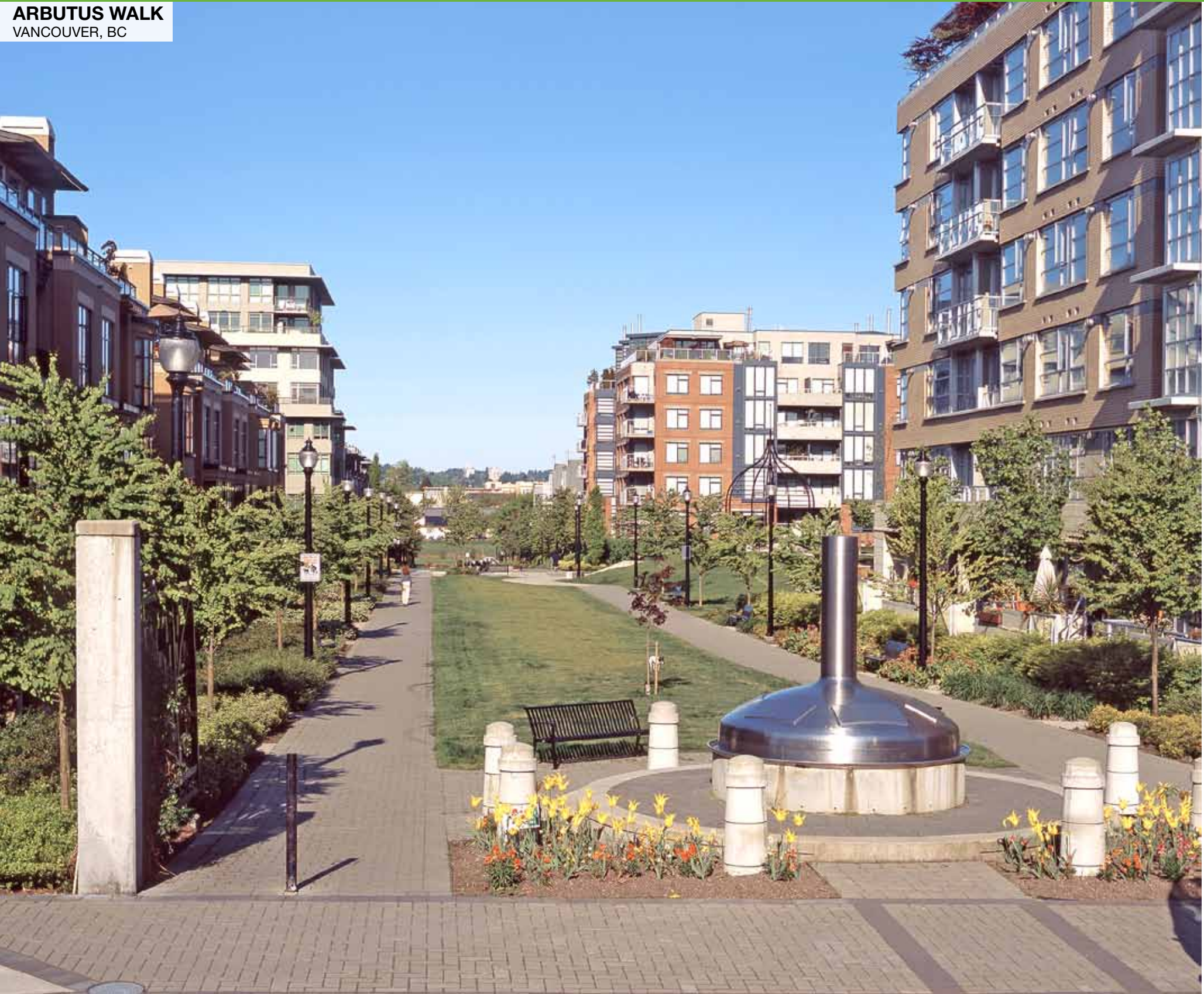
ARBUTUS WALK VANCOUVER, BC