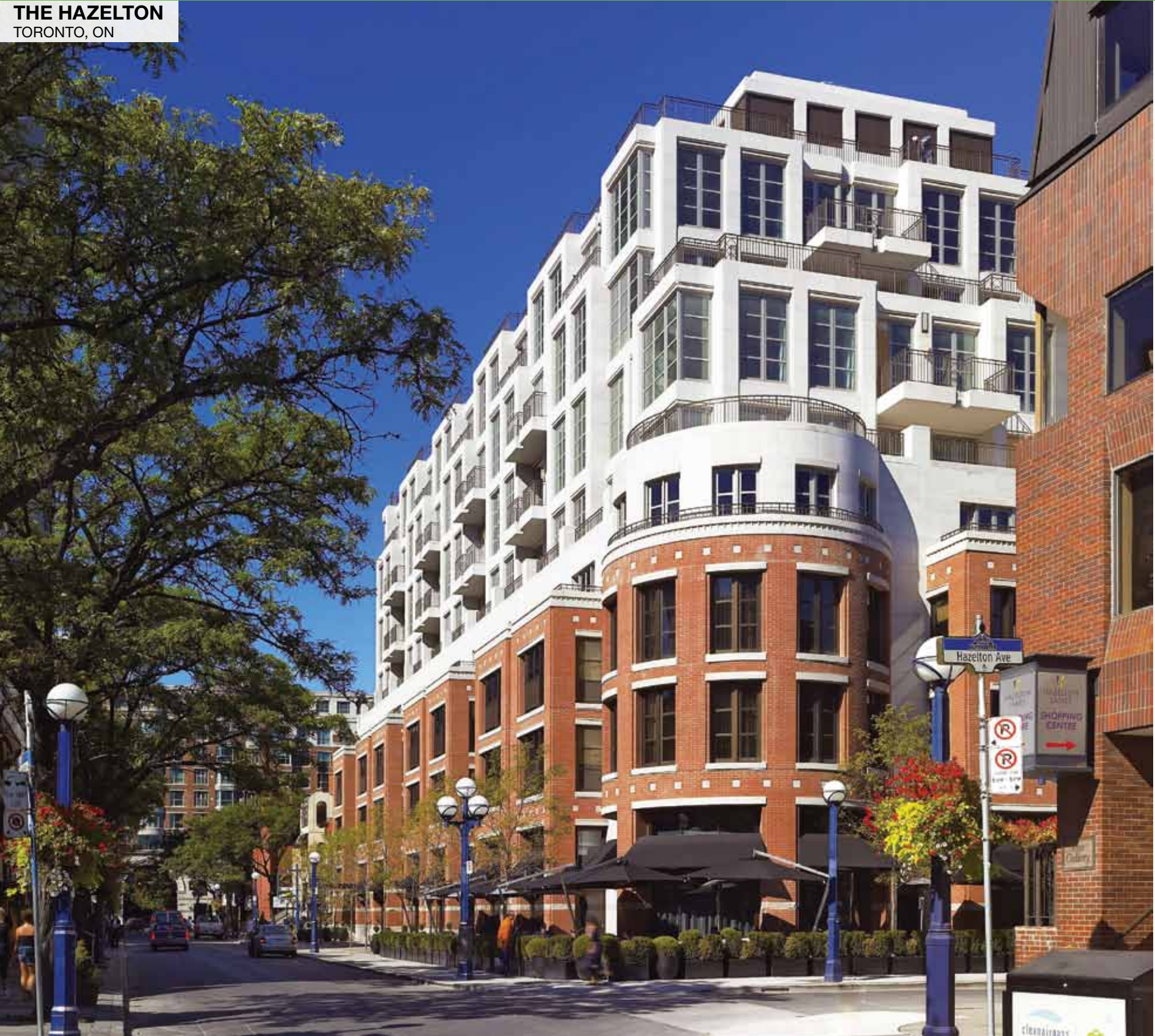
THE HAZELTON TORONTO, ON